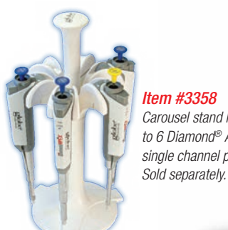
Item #3358 Carousel stand holds up to 6 Diamond® APEX™ single channel pipettors.